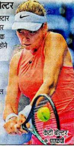
केटी वोल्टर

टोक्यो, आइएनएस: 28 वर्षीय ब्रिटिश टेनिस स्टार केटी वोल्टर ने डब्ल्यूटीए टूर के एशियाई दौर पर अपने खराब प्रदर्शन को पलटते हुए पैन पैसिफिक ओपन के सेमीफाइनल में जगह बना ली है। उन्होंने पूर्व यूएस ओपन चैंपियन बियांका एंड्रीस्कू के खिलाफ 6-2, 6-1 से शानदार जीत दर्ज की। हाल के टूर्नामेंटों में शुरुआती दौर में बाहर होने के बाद वोल्टर ने शानदार कमबैक करते हुए एंड्रीस्कू पर शानदार जीत दर्ज की। सेमीफाइनल में वोल्टर का सामना अब एक अन्य ग्रैंड स्लेम चैंपियन सोफिया केनिन से होगा। 2020 आस्ट्रेलियन ओपन विजेता ने अपने क्वार्टर फाइनल मैच में पांचवीं वरीयता प्राप्त डारिया कसाटकिना को 6-3, 6-4 से हराया।